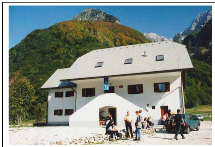
Mountaineering Education Centre Bavšica